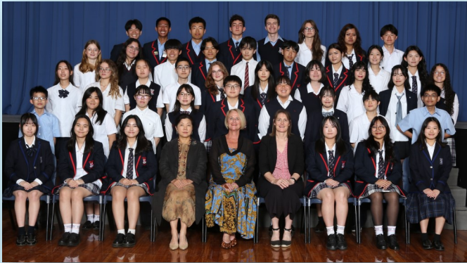
International Students Photo 2025