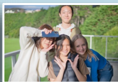
Pizza Night at School