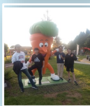
Student Trip to Ohakune